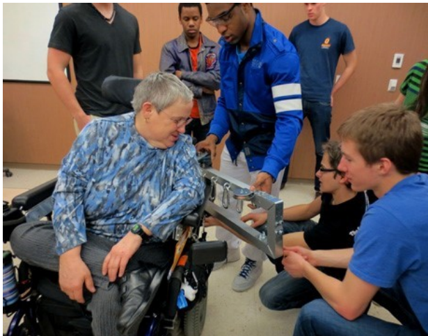
Queen's first year engineering students fit a prototype device to their community partner's wheelchair for easy access to store bags hung on the back of the chair.

If you have a project that you would like to propose, or would like more details, please contact us!